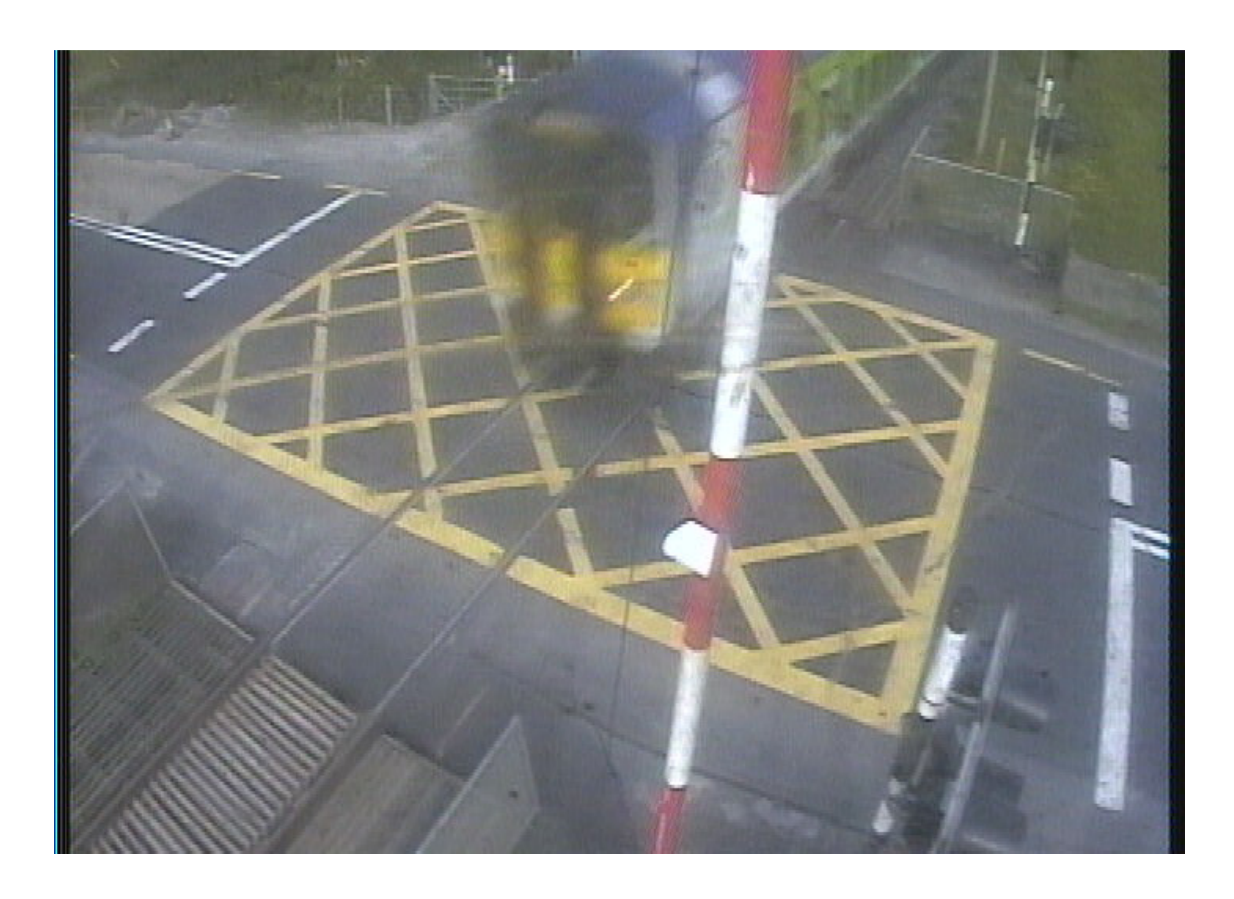
Near miss at Ballymurray level crossing on the 14<sup>th</sup> of June 2008 between Athlone and Westport

Report 08061401 (issued 11<sup>th</sup> of May 2009)