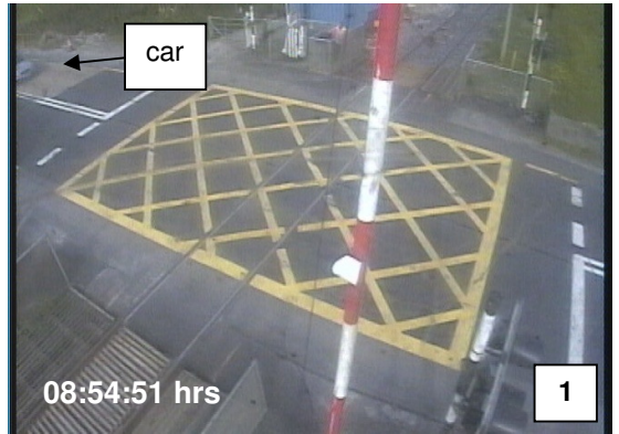
A car approaches the crossing

On Saturday the 14<sup>th</sup> of June 2008 at 8.50 hours (hrs) an empty Diesel Multiple Unit (DMU), identification number J851, which was carrying out an empty transfer movement, travelling from Manulla Junction to Dublin, passed through the raised barriers of Ballymurray level crossing, which is an Automatic Half Barriers (AHB) type level crossing. Approximately two seconds prior to the DMU passing a car crossed through the level crossing. The incident was recorded on closed-circuit television (CCTV) of which the following photographs are taken at one second intervals: