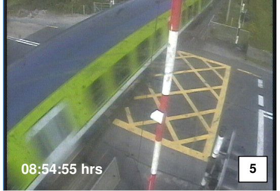
The train drives through the crossings while the barriers are raised