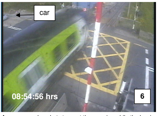
A car approaches, but stops, at the crossing while the barriers are raised and the train is crossing