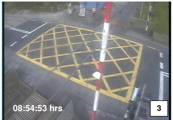
The car clears the crossing