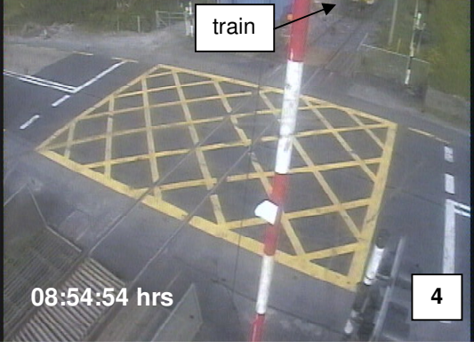
A train approaches the crossing while the barriers are raised