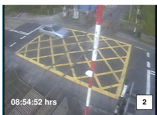
The car drives through the crossing